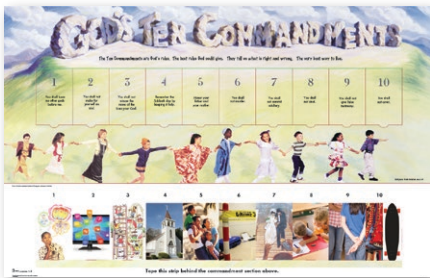
"God's Ten Commandments" Teaching Aid

Objective: That your students will recognize ways children today can put God first.