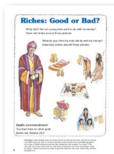
My Bible Book , page 4

In today's story the rich young man thought he had been obeying all of God's rules, but he had forgotten about one of them. Let's turn to page 4 in My Bible Book to see what rule he forgot. Have a volunteer read the commandment in the lower left corner. Briefly explain that this commandment means we should not love anything more than God.