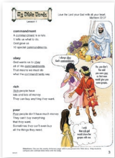
My Bible Book, page 3

Objective: That your students will learn, from the example of the rich young man, that God wants us to love Him more than money.