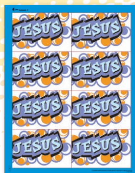
"Jesus, Here's How I'll Put You First" Teaching Aid