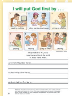
My Bible Book, page 6

Allow time for writing, helping as needed. Ask the children to each choose a place to put