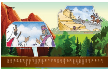
Bible Overview Chart Teaching Aid

Jesus knew that this young man loved his money