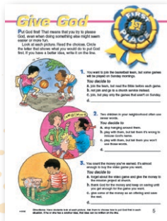
My Bible Book, page 5

Objective: That your students will decide how they will put God first this week.