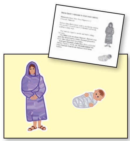
Story Mat with Story Figures 1, 2, and Story Card 1

Even if you tell the story to just one child at a time, repeat it to each child or small group. Young children need to hear and do things more than once.