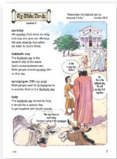
My Bible Book, page 7

Objective: That your students will learn from Jesus' example how to honor God's day.