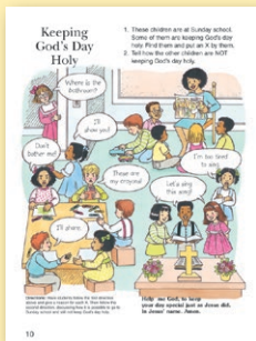
My Bible Book , page 10

Have the class read the prayer aloud in unison.