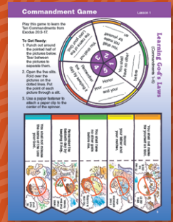
Elementary Kid Crafts, Lesson 1