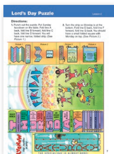
Elementary Kid Crafts, Lesson 2

Turn in your Bibles to Exodus 20:8 and let's read it together. That's the memory verse we learned earlier today. One way we can keep the Sabbath day is to make a special day to honor God. Let's work together to create a puzzle to help us remember to make Sunday a special day to honor God.