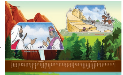
Bible Overview Chart Teaching Aid

Have the children find Exodus 20:8 in their Bibles and bookmark it for later use. If you have children who are unsure of its location, remind them to turn to the table of contents in the front of their Bibles to find the page number for Exodus.