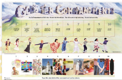
"God's Ten Commandments" Teaching Aid

Gather near the "God's Ten Commandments" Teaching Aid and review the first three commandments from last week. If time allows, read the poems again. Then read the fourth commandment and poem, and discuss the picture of the church building. In our Bible story Jesus worshiped God at the synagogue.