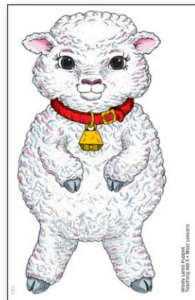
Wooly Lamb Teaching Aid 3

Many people take care of us. Today we're going to learn that God takes care of us. Our Bible story today tells us about one of God's helpers, a man named Elijah. As you hear the story, listen for how God takes care of Elijah.