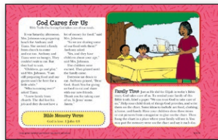
My Sunday Pictures Lesson 2 (back)