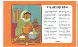
My Sunday Pictures Lesson 2 (front)