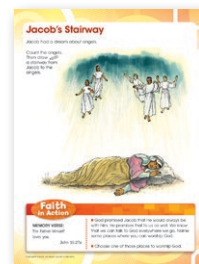
Storytime, Lesson 3, page 4

Distribute Storytime for Lesson 3 and help children do the activities on page 4.