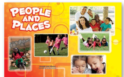
“People and Places” Teaching Aid 3

We go to a lot of places and a lot of others go with us. Our Bible story is about a man named Jacob. He was going to a place. He thought he was going by himself—but he wasn’t. Listen to learn who was with Jacob.