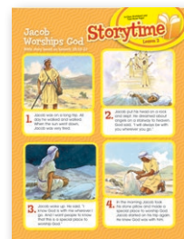
Storytime, Lesson 3, page 1

Say a personal goodbye to each student. Worship God everywhere you go.