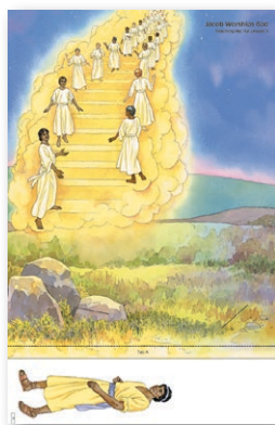
“Jacob Worships God” Teaching Aid 5

God was standing above the stairway and He said to Jacob, “I am the Lord. I am the God of your grandfather Abraham and the God of Isaac. I will bring you and your children back to this land. I will give you this land. I am with you and will watch over you wherever you go. I will not leave you. I will keep my promise.”