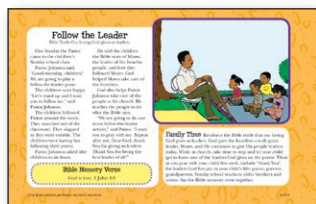
My Sunday Pictures Lesson 3 (back)