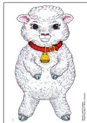
Wooly Lamb Teaching Aid 3

Have children sit in a circle. Bring out the "Wooly" puppet teaching aid. Good morning, children. (Have Wooly whisper to you.) Wooly says he is very tired this morning. He had to follow his shepherd to a new meadow where there was lots of delicious green grass to eat. (Have Wooly whisper to you.) Then the shepherd led Wooly to a river that had cool water for him to drink. (Have Wooly whisper to you.) Wooly wants to know if you have ever followed someone. Allow for responses. Put Wooly away.