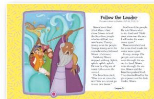
My Sunday Pictures Lesson 3 (front)

Say a personal goodbye to each child. God gives us good leaders. Thank Him this week for your leaders.