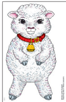
Wooly Lamb Teaching Aid 3

People give us rules because they love us. They know rules help us stay happy and safe. Today we're going to learn that God gives us rules. In our Bible story today, God gave Moses and the Israelites 10 rules. As you listen to the story, try to remember one rule God gave them.