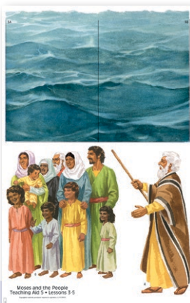
"Moses and the People" Teaching Aid 5