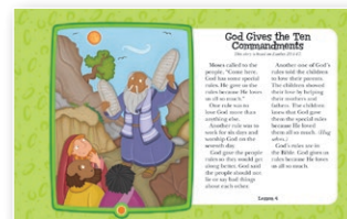
My Sunday Pictures Lesson 4 (front)

Show children the Bible picture story on My Sunday Pictures . Today we learned that God gave Moses and the Israelites rules. God gave them the rules because He loved them. What does God give us? (God gives us rules.)