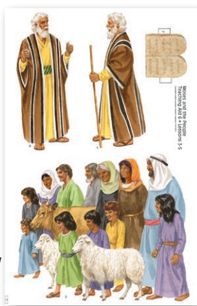
"Moses and the People" Teaching Aid 6

(Put Figure 6, the people standing, to the right of Figure 8.) God gave Moses and the Israelites rules. God's rules are for us, too. God gives us rules.