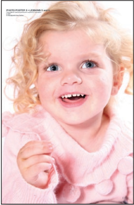
Photo Poster 5

Show Photo Poster 5. Point to the girl. Here is a girl. Point to the girl’s eyes. Here are the girl’s eyes. Point to your eyes. Have the children point to their eyes. We can see with our eyes. What are some things you see with your eyes? Encourage all the children to talk about things they see with their eyes. Some children may feel more comfortable pointing to something they see rather than talking. Be prepared to give examples in the classroom to help them begin. We see many things. Today we are going to learn that God made our eyes.