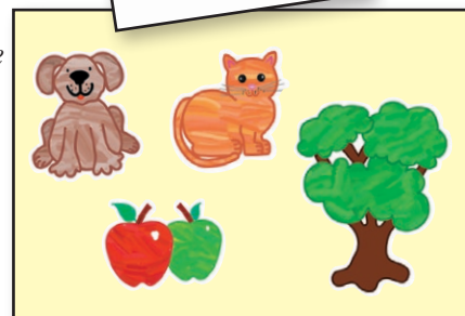
Story Mat with Story Figures 6, 7, 8, 9, and Story Card 5