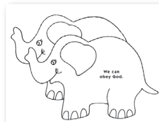
Make-It/Take-It Page 3

Remove the elephant patterns from page 3 of the Make-It/Take-It books. Give each child an elephant pattern. Elephants are supposed to be good at remembering. These elephants remind us we can obey God. We can each put the elephants in places to help us remember that we can obey God. Where could you put your elephants at home to help remember that we can obey God? (Children may talk about places at home such as a bedroom, the refrigerator door, or the car.)