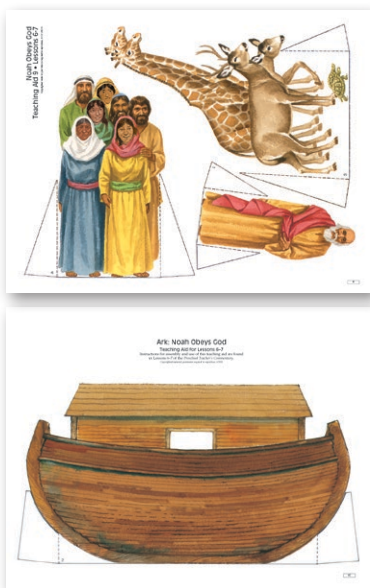
“Noah Obeys God” and “Ark: Noah Obeys God” Teaching Aids 8 and 9

2. How did Noah obey God? (He did all that God told him to do.)