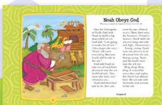
My Sunday Pictures Lesson 6 (front)

We can obey God too. How can you obey God? (Talk to God; listen to Bible stories; show love to others; listen to our parents.)