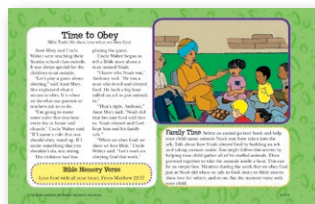
My Sunday Pictures Lesson 6 (back)