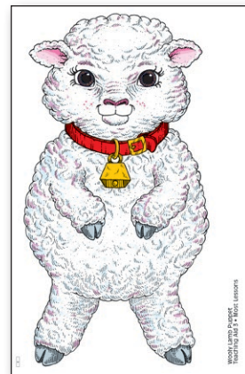
Wooly Lamb Teaching Aid 3

We obey someone because we love them. Today we're going to learn that we can obey God. Our Bible story tells us about a man named Noah who loved God. As you hear the story, listen to find out how Noah obeyed God.