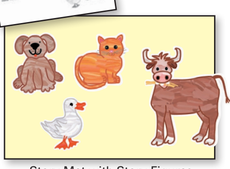
Story Mat with Story Figures 6, 7, 10, 11, and Story Card 6

Repeat this story with each group or child. Repeating the story will help the children understand and remember the Bible story.