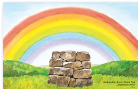
“Noah and His Family Thank God” Teaching Aid 10

Every time we see a beautiful rainbow after it rains, we can remember God’s promise. We can thank God too, like Noah did.