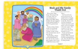
My Sunday Pictures Lesson 7 (front)