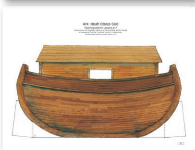
“Noah Obeys God” and “Ark: Noah Obeys God” Teaching Aids 8 and 9