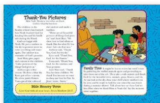
My Sunday Pictures Lesson 7 (back)