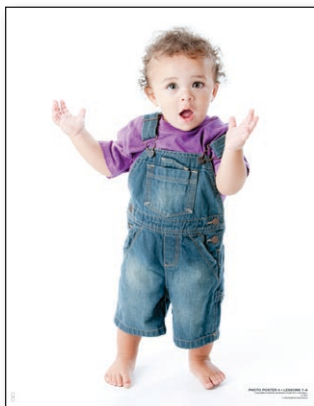
Photo Poster 6

■ Materials: Creative Teaching Aids—Photo Poster 6