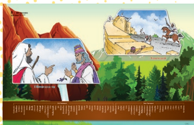
Bible Overview Chart Teaching Aid

Have a volunteer find Jonah on the Bible Overview Chart. Talk about how last week's lesson was in the New Testament. Today's Bible story is in the Old Testament.