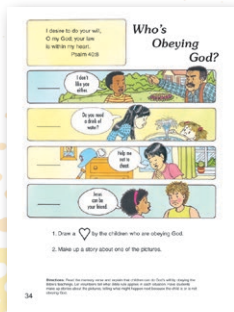
My Bible Book, page 34

Objective: That your students will learn ways to know what God wants and desire to obey Him, even when it's hard.