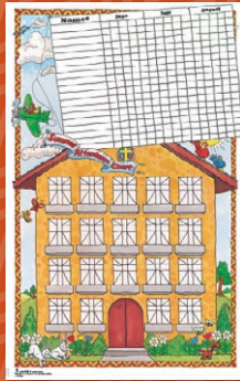
"Attendance Chart" Teaching Aid