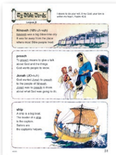
My Bible Book, page 31

Objective: That your students will learn from Jonah's example that it is unwise to disobey God.