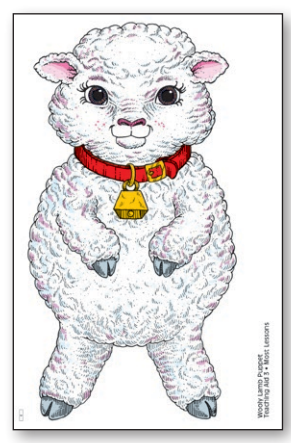
Wooly Lamb Teaching Aid 3

Wooly, can you tell the children why you had a haircut? (Wooly whispers to you.) Wooly says that he wanted to give a birthday gift to his shepherd's little girl. (Wooly whispers