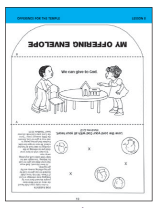
Make-It/Take-It for Lesson 8

Before class, remove Lesson 8 from each MakeIt/Take-It and pull off the margins. Punch out the three coin stickers for this lesson from the center of the book. It will make it easier for your students if you fold the project on the broken lines, then unfold the sheet so they can use your crease lines as guides.