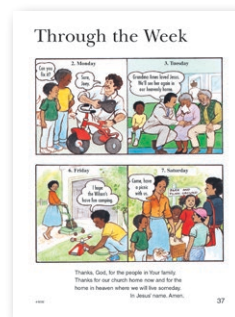
My Bible Book, page 37

As your students leave, make sure they have My Bible Book , pages 35-38 and the autograph book from Elementary Kid Crafts . Remind them again to bring back the autograph books.