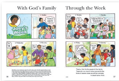
My Bible Book, pages 36-37

Objective: That your students will discuss ways that people in a church family can help one another.