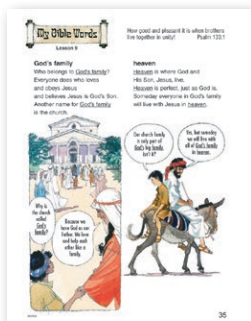
My Bible Book, page 35

Objective: That your students will tell what John taught about our church home and our heavenly home.