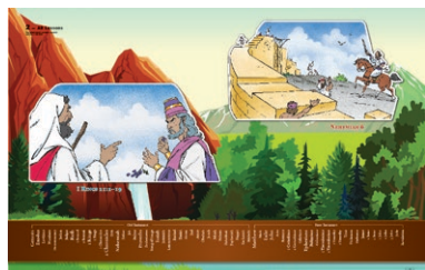
Bible Overview Chart Teaching Aid

God had John, one of Jesus’ disciples, write about heaven. Heaven will be a perfect home for all of God’s family. Today’s story will teach us more about heaven.