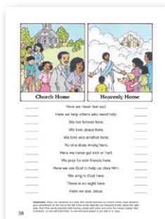
My Bible Book, page 38

Ask each student to tell what they liked best about the Bible story.