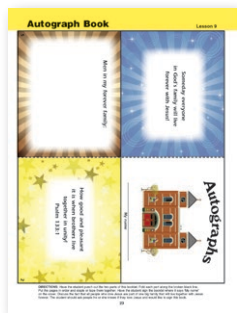
Elementary Kid Crafts, Lesson 9

Distribute Lesson 9 from Elementary Kid Crafts . Have students assemble their autograph books according to the directions on the craft sheet.