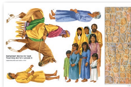
“Nehemiah Works for God” Teaching Aid 12