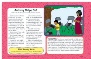
My Sunday Pictures Lesson 9 (back)

What can we do together? (We can work together for God.) Can you name some of the things we did today where we had to work together? (Let the children share their ideas.