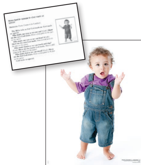
Photo Poster 6 and Story Card 9

Repeat the story to each child or small group. Young children need to hear and do things more than once.