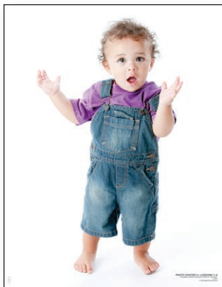
Photo Poster 6

Show Photo Poster 6. These are eyes. Point to the boy’s eyes in the poster.