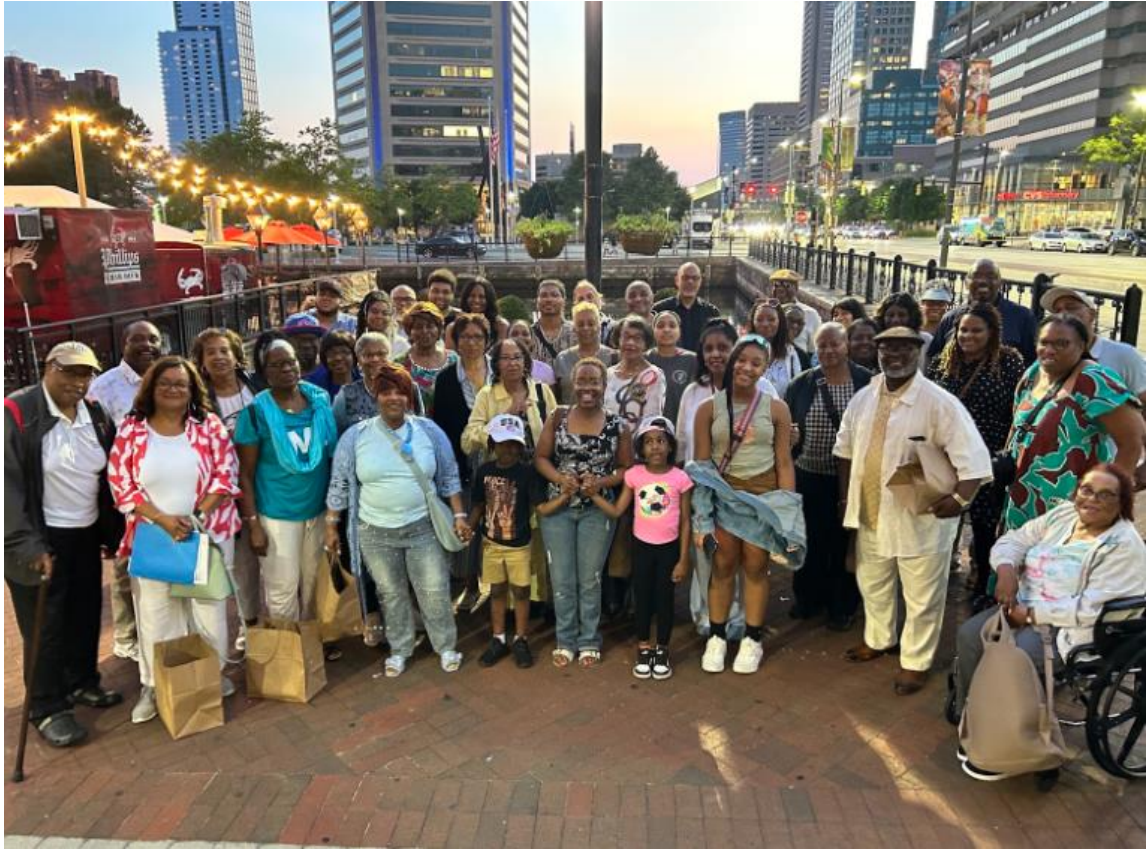
African-American Museum Trip