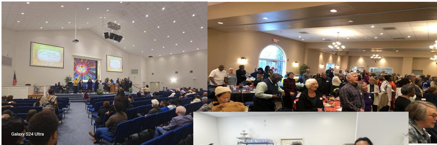
Church Service Christ Cultural Humility Session Heavenly Brews Staff